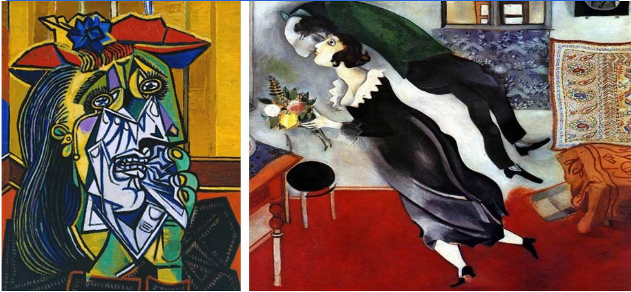
Above left: Pablo Picasso, "The Weeping Woman" (1937); above right: Marc Chagall, "Birthday" (1915).