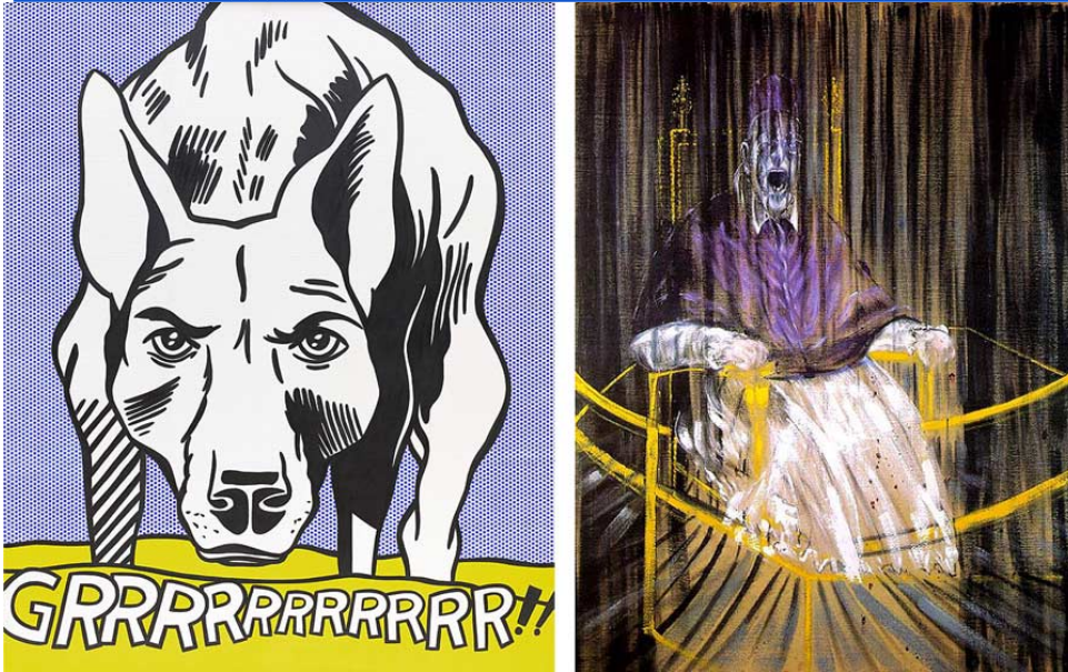
Above left: Roy Lichtenstein, "Grrrrrrrrrr!!" (1965); above right: Francis Bacon, "Study after Velazquez's Portrait of Pope Innocent X" (1953).