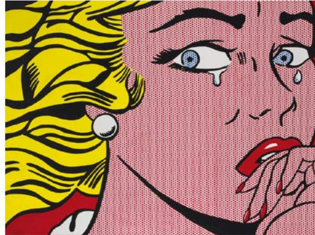
Above left: Henri Matisse, "Dance II" (1909-1910); above right: Roy Lichtenstein, "Frighten Girl" (1966).